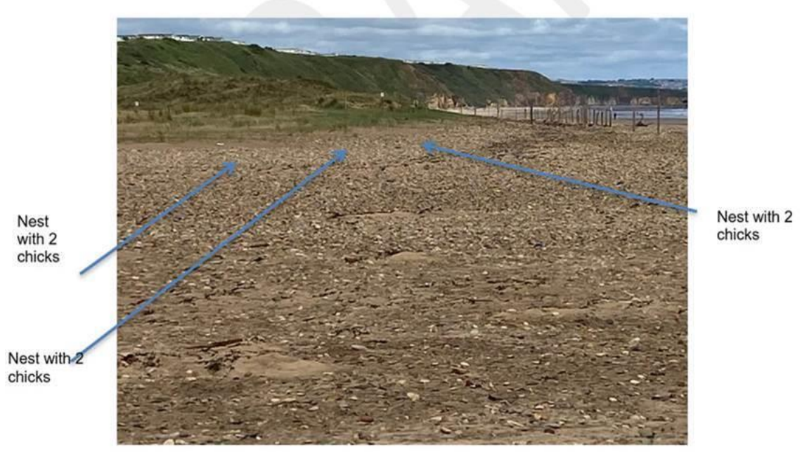
The area to the south of the main colony area where the terns successfully nested.

6.1.326.1.36 Given that the known nesting sites for avocets and terns would be subject to a nitrogen dose far lower than 1% of the Critical Load, it is unlikely that atmospheric pollution from the Proposed Development would have significant impacts on the SPA's / Ramsar's breeding bird interest 'alone'. Moreover, in practice the suitability of an area for nesting terns will be less tied to the specific Critical Load (which is only a rough proxy for tern nesting habitat) and precise botanical effects, and more to do with coarse habitat structure i.e. they nest on the beach just above the high tide line, which is very sparsely vegetated (see below screencap from the 2020 Cleveland Little Tern Project Monitoring Report<sup>13</sup> for an image of the nesting location).